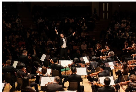
Hong Kong Philharmonic Orchestra