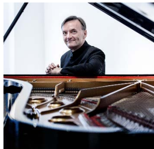
Stephen Hough